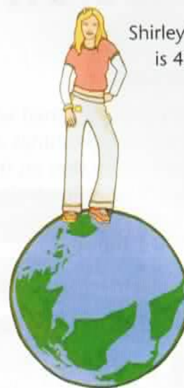
Shirley's mass is 45 kg